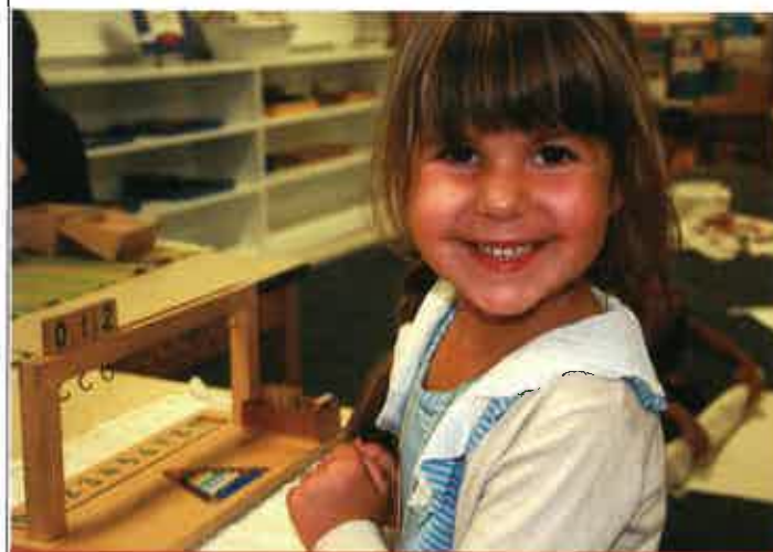
Loving to Learn Starts Here